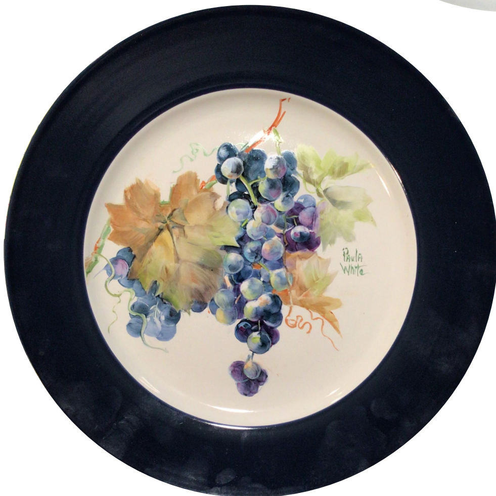
Second Fire of Two Fire Blue Grape Study for IPAT Zoom